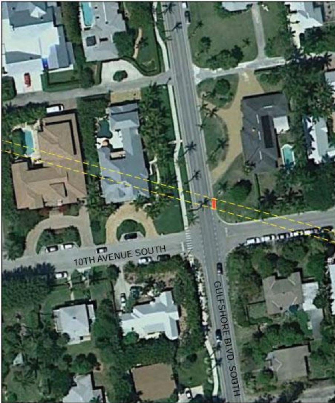
Figure 2. Naples Canal, 8CR59, location relative to Gulfshore Boulevard South utility trench excavation.